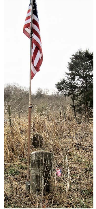
Tombstone with its whitewashed face (left), date of photo unknown; and as it looked in Feb 2019 (center and right).