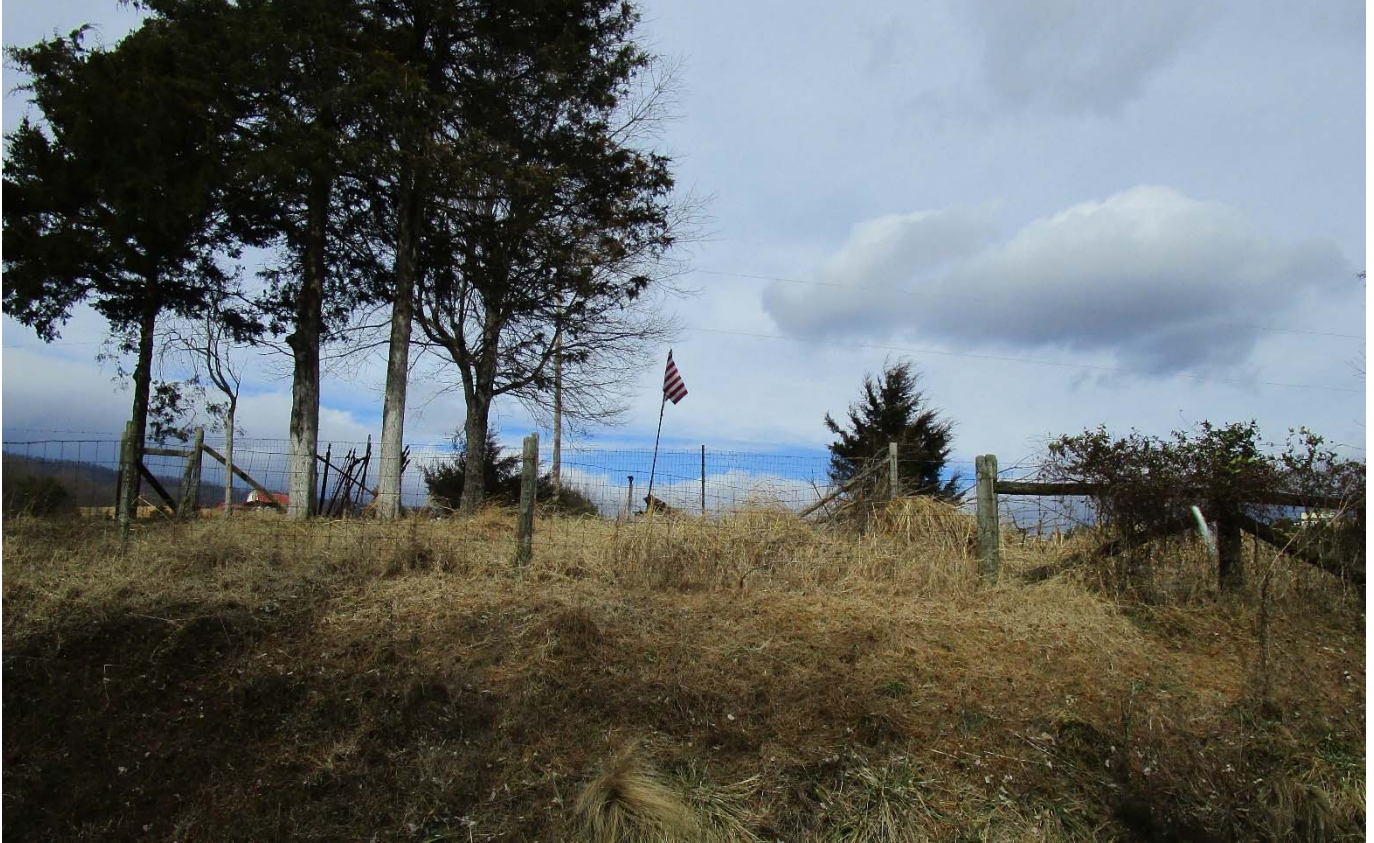
Charles Keyser Cemetery 17 February 2019