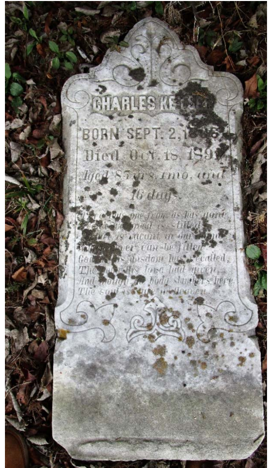
The marker when it was still upright (left) at an unknown date, and lying on the ground as found in 2019 (right).