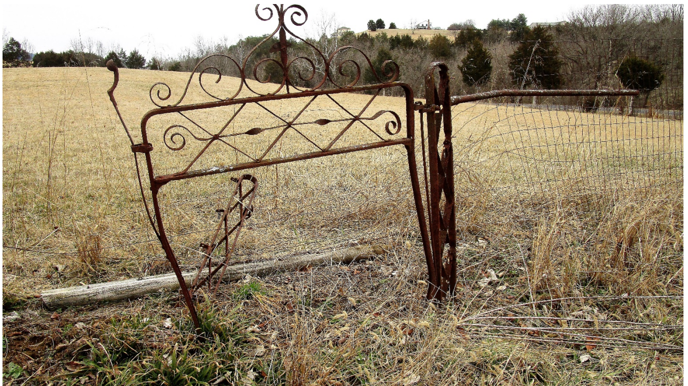
Cemetery gate has all but disintegrated over the years.