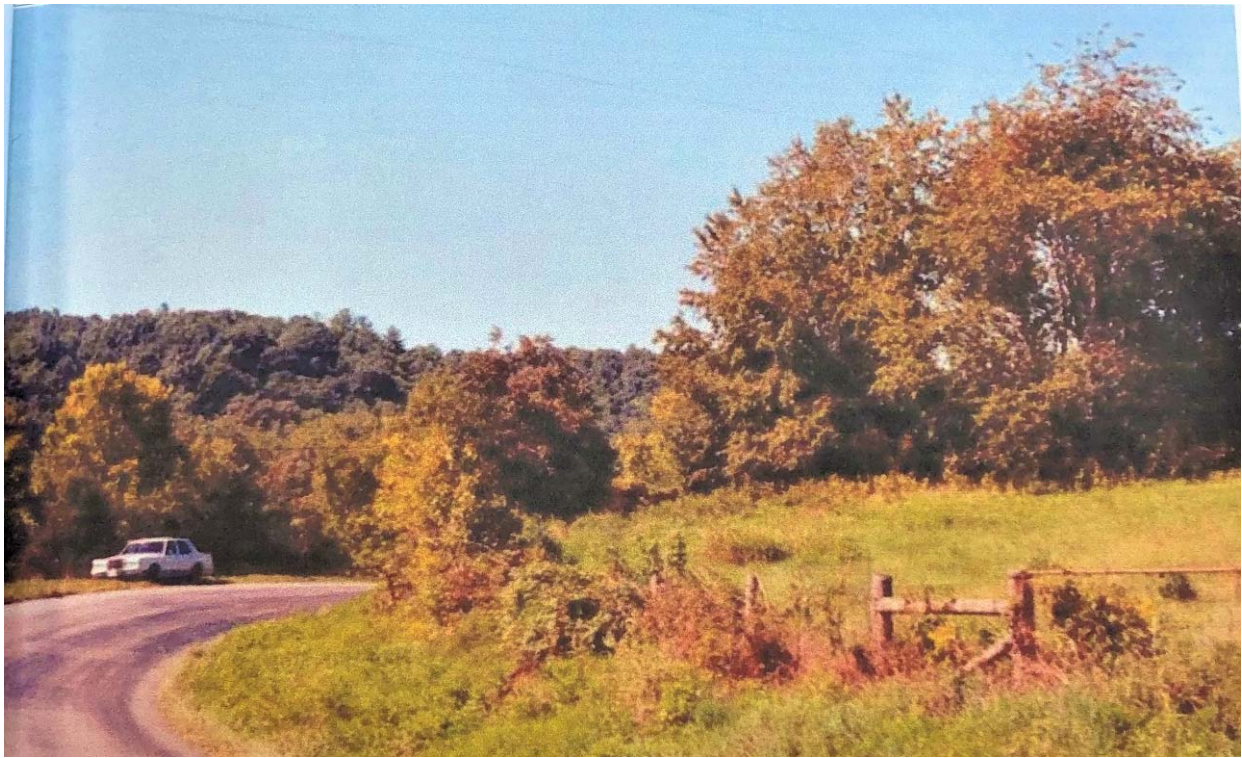
Charles Keyser, Sr. Cemetery, Page County, Virginia, in the little clump of trees on the right. Owen's car in the distance. Sep 1999. Before cleanup.