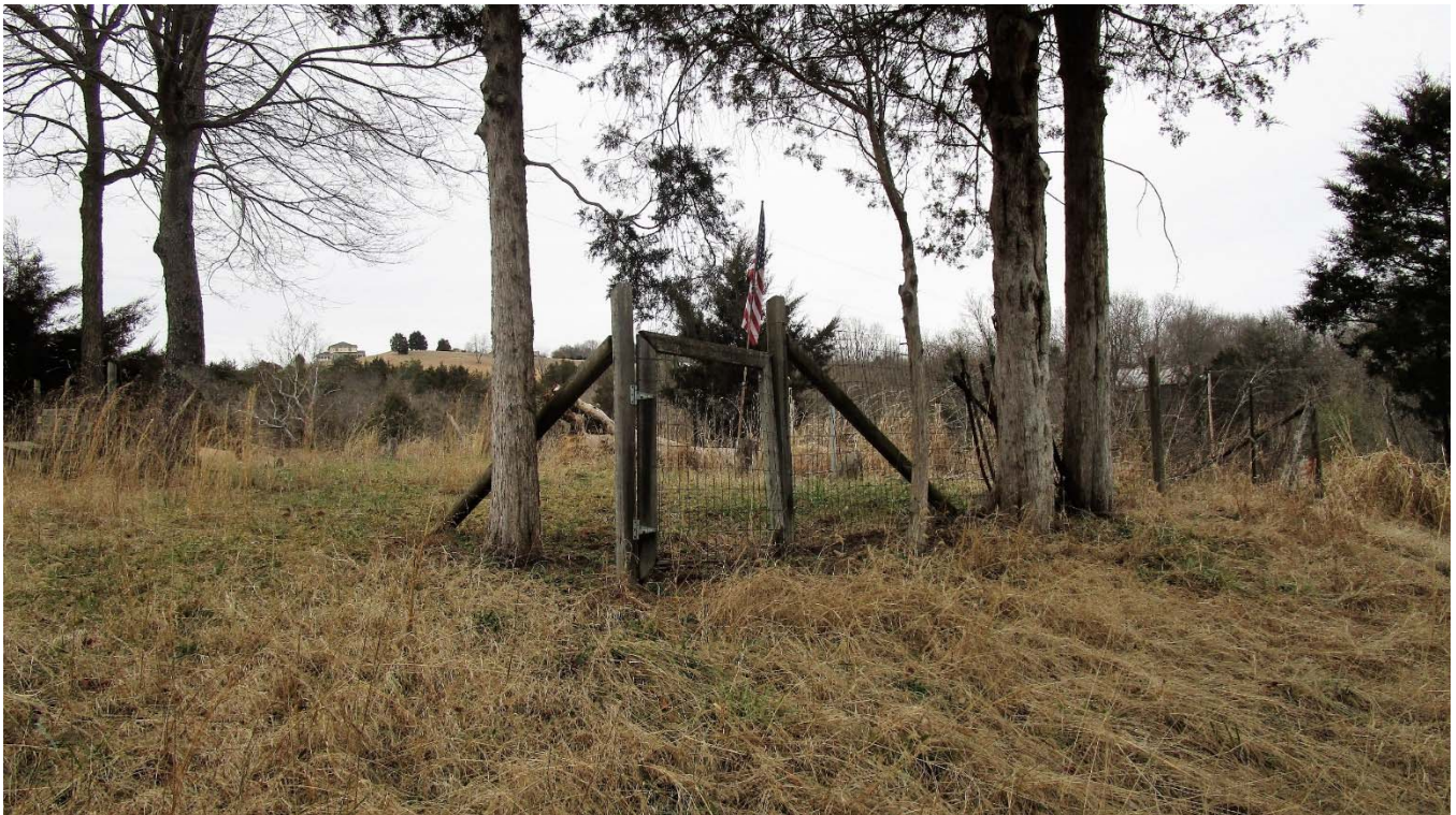
Most of the old cemetery fence is now missing and needs to be replaced.