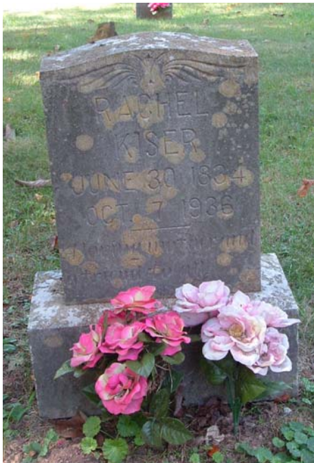
Kiser Cemetery No. 1