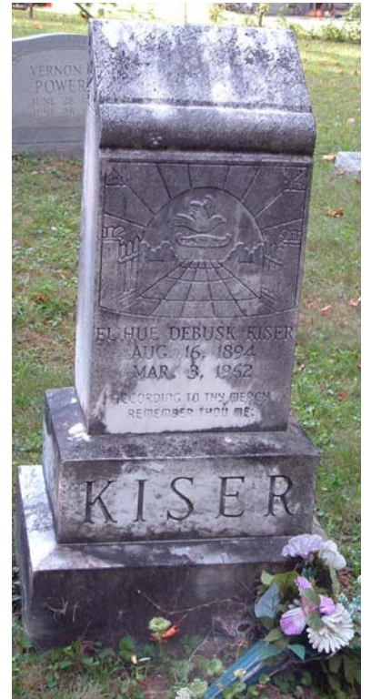
Cemetery No. 7 Elihue Debusk Kiser