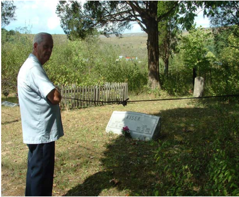
Cemetery No. 5

Coal Mining going on up on the ridge above