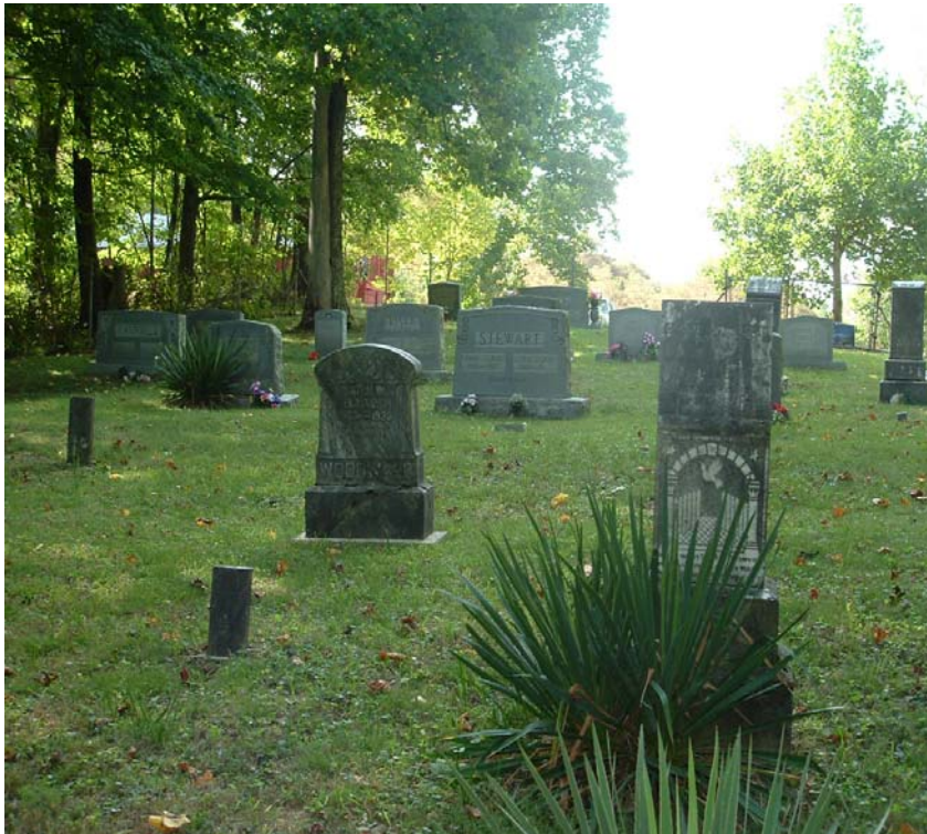
Cemetery No. 7