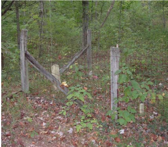
Cemetery No. 6

7. Continue on Chaney Creek Rd. over the mountain. Just before the intersection of Chaney Creek Rd. and Hazel Mtn. is another cemetery on the L. If you go R at the intersection, it leads to Sandy Ridge. If you go L it goes to Bear Wallow Hollow and Dante. This cemetery is very pretty and well cared for.