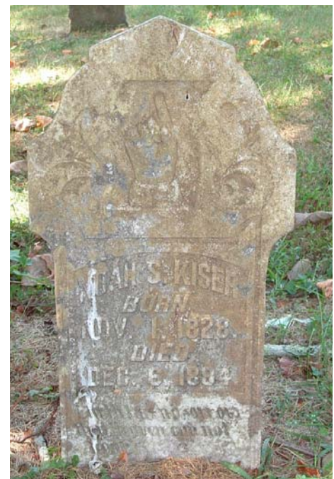
Kiser Cemetery No. 1

2. There is a road that goes up along side of the cemetery. Owen said that it led to another Kiser cemetery but that the land is owned by Clinchfield Coal Co., who denies access to it and it requires a court order to go there.