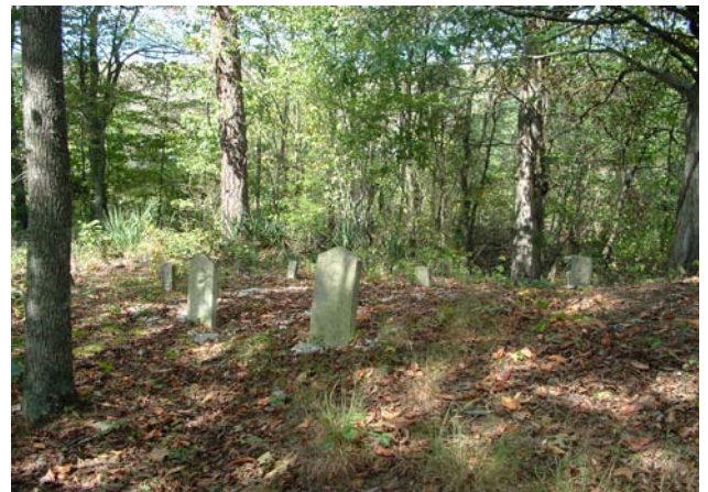
Cemetery No. 5

6. Turn back around to main road and turn R. Continue to Chaney Creek Rd. (616) and go R. This cemetery is on a hill and is where the Kiser monument is located. There are several more small fenced off lots hidden back in the woods. Monument reads: