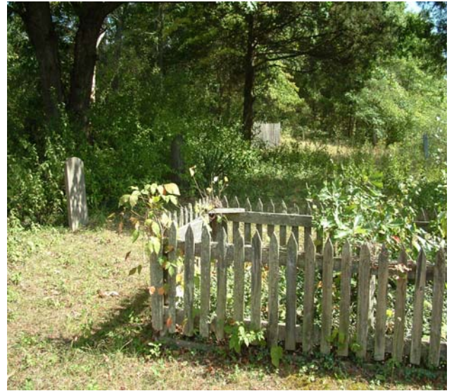
Cemetery No. 5

Coal Mining going on up on the ridge above