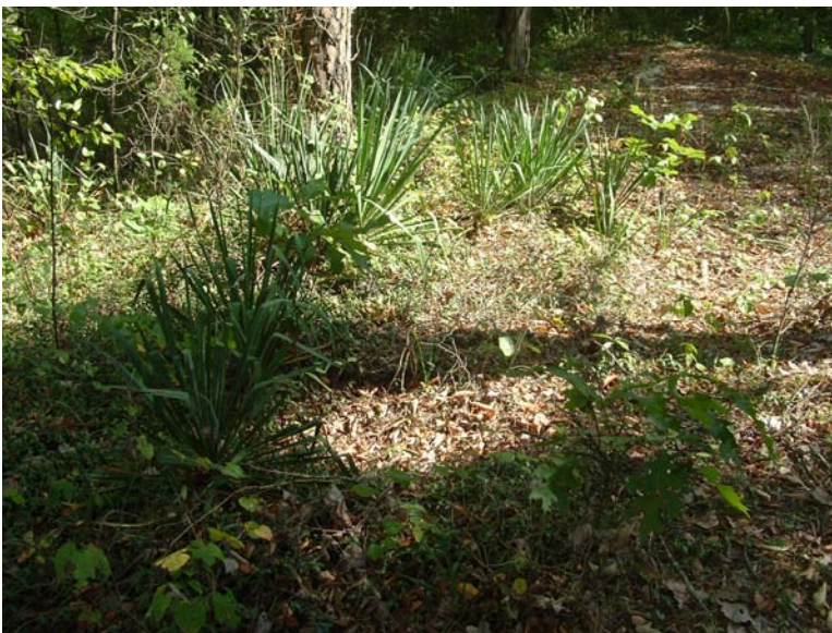
Cemetery No. 5 unknown sunken grave